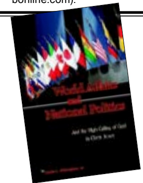
258 pp., PB See order form.

- An Alphabetical Analysis, Volume 2, pages 276-286 (edited & abridged)