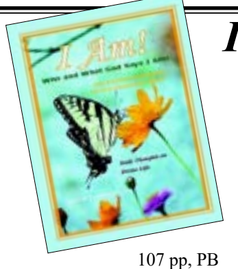
See order form.

I've read the first article in BSN 549 - Our Attitude Towards Others. WOW! I love it! That's just exactly what I've been trying to teach and live (sometimes not so well as other times). Thank you SO much for that word of inspiration and encouragement. I'm so glad this is going out to others. It is so important for us to remind each other that love and fellowship is far more important that selfrighteousness and doctrine. Love your work my brother and friend! - Canada