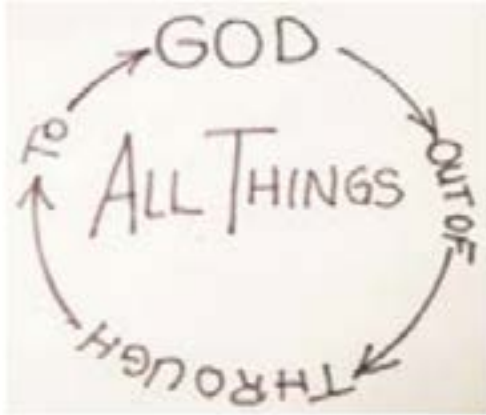
The Divine Cycle

“out of” ( ek ) → “through” ( dia ) → “to” ( eis )