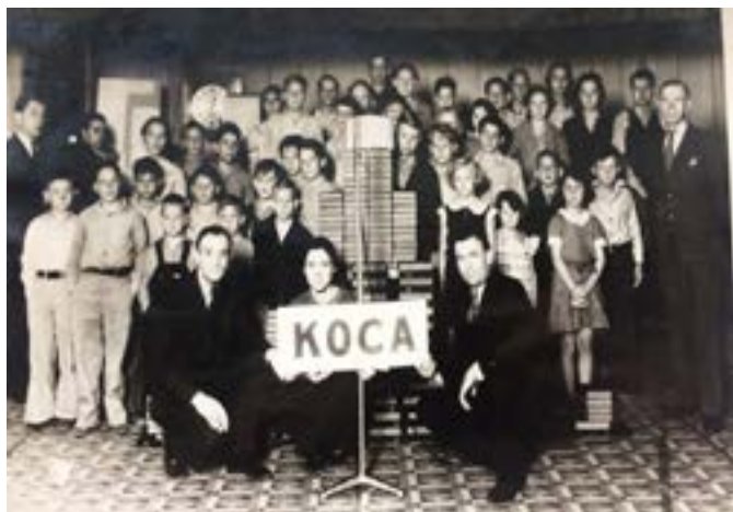
Early Radio Ministry: KOCA, Kilgore, TX

In the early 1940's he taught a daily, 15-station network radio program, Crossroads Counselor , became an editor of The Differentiator , and was contributor to periodicals such as, The Link , Revelation , Our Hope , Revelator , and War Cry .