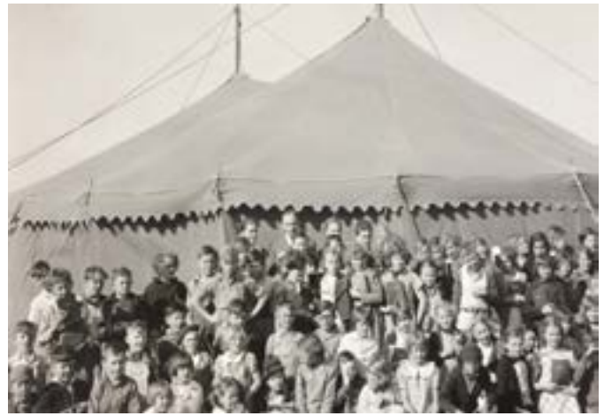
Youth Tent Rally, Overton, TX