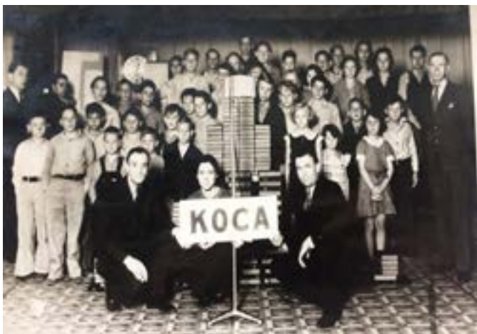
Early Radio Ministry: KOCA, Kilgore, TX

In the early 1940's he taught a daily, 15-station network radio program, Crossroads Counselor , became an editor of The Differentiator , and was contributor to periodicals such as, The Link , Revelation , Our Hope , Revelator , and War Cry .