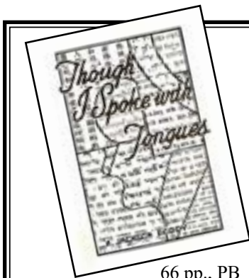
66 pp., PB See order form.

Major: Evil; God; Patience; Suffering Minor: Repent; Satan; Sin