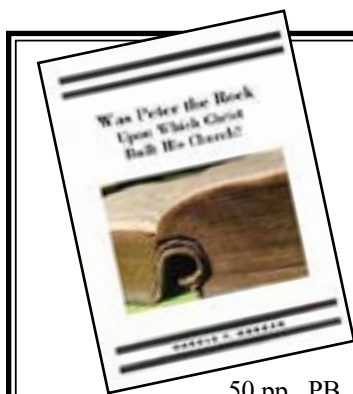
50 pp., PB See order form.