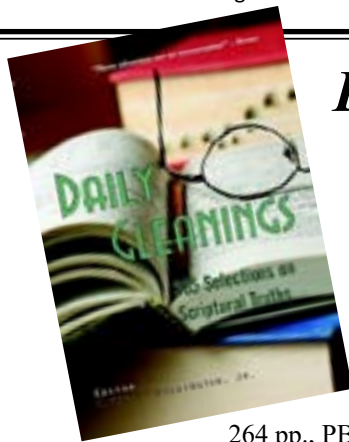
264 pp., PB