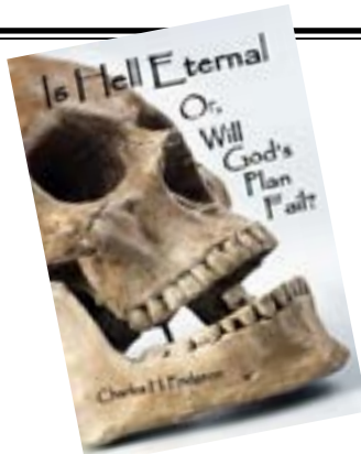
344 pp, PB See order form.